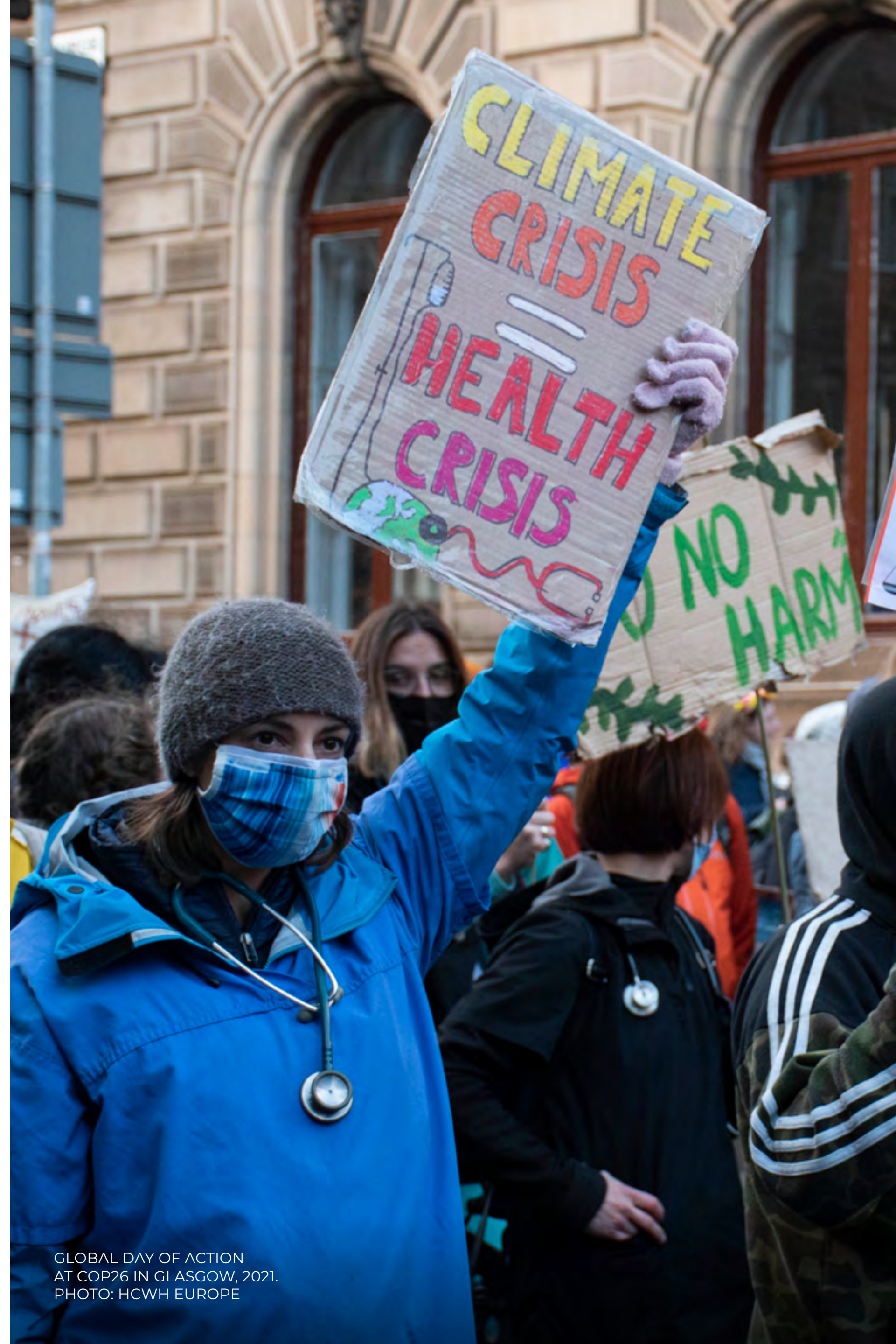
GLOBAL DAY OF ACTION AT COP26 IN GLASGOW, 2021.