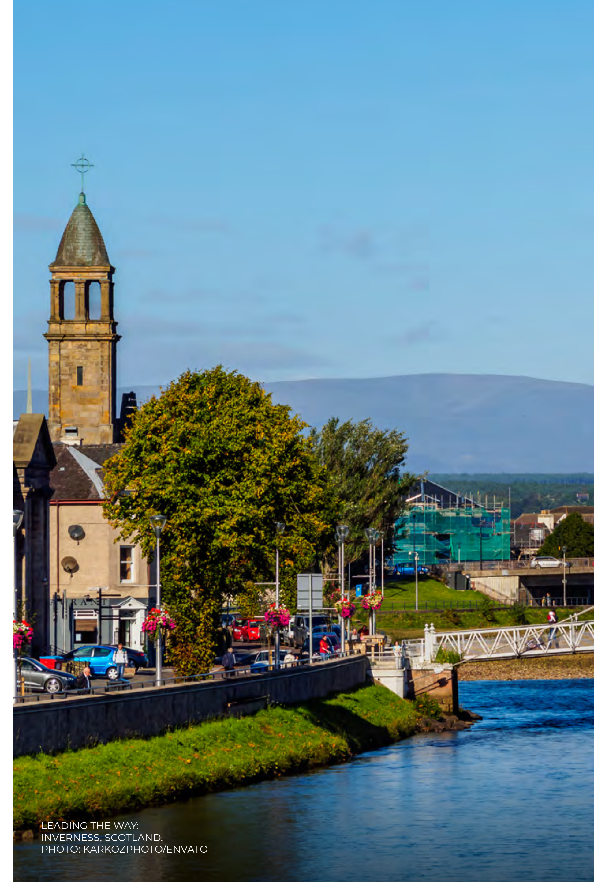
LEADING THE WAY: INVERNESS, SCOTLAND.

But there could only be one winner. Announced at the CleanMed Europe conference, NHS Scotland won the top spot for their Green Anaesthesia Scotland project that works to reduce the environmental impact of medical gases across healthcare services in Scotland.