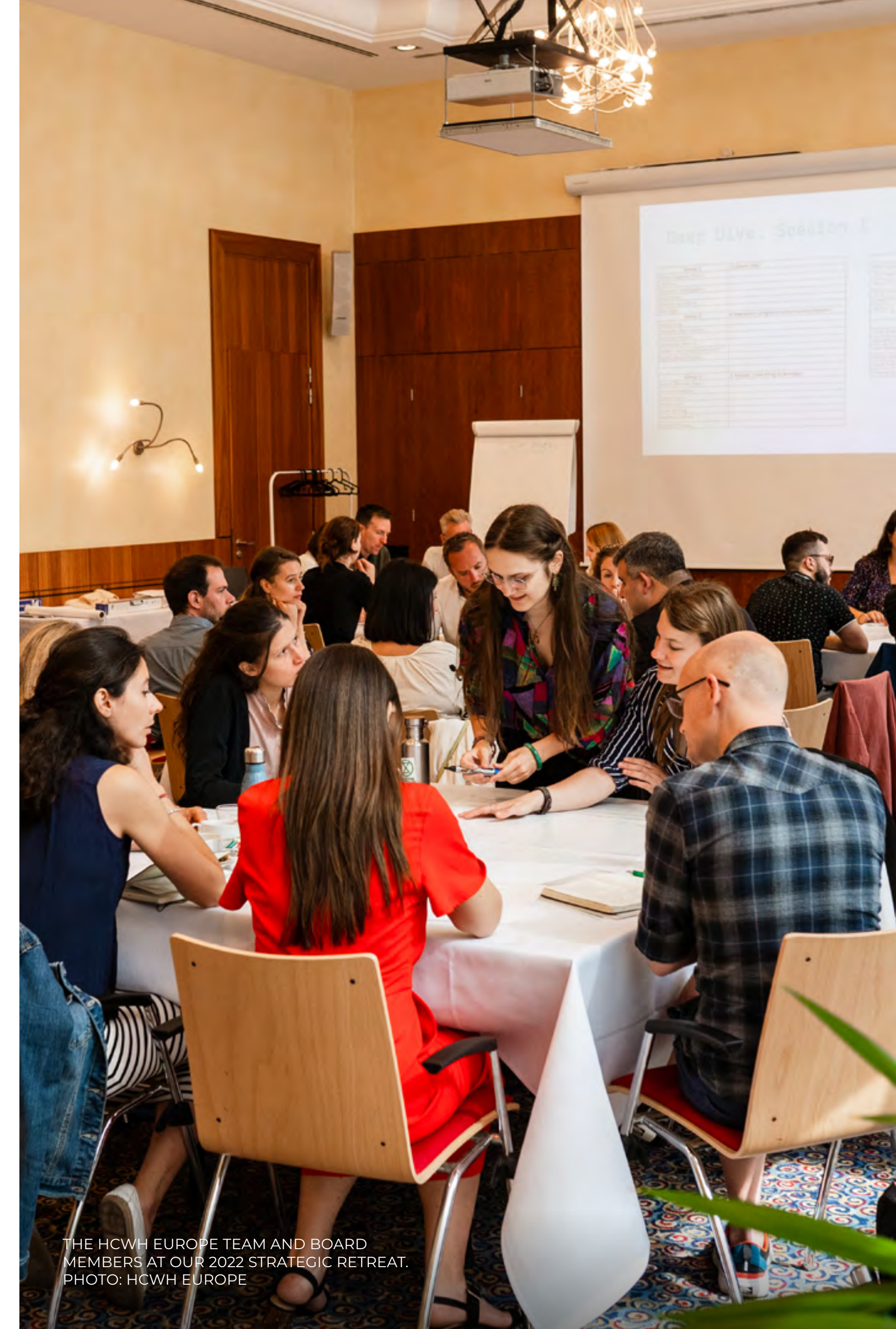
THE HCWH EUROPE TEAM AND BOARD MEMBERS AT OUR 2022 STRATEGIC RETREAT.

As we celebrate our 20th anniversary, we want to thank and recognise each and every one of our members, sponsors, partners, funders, and donors over the years.