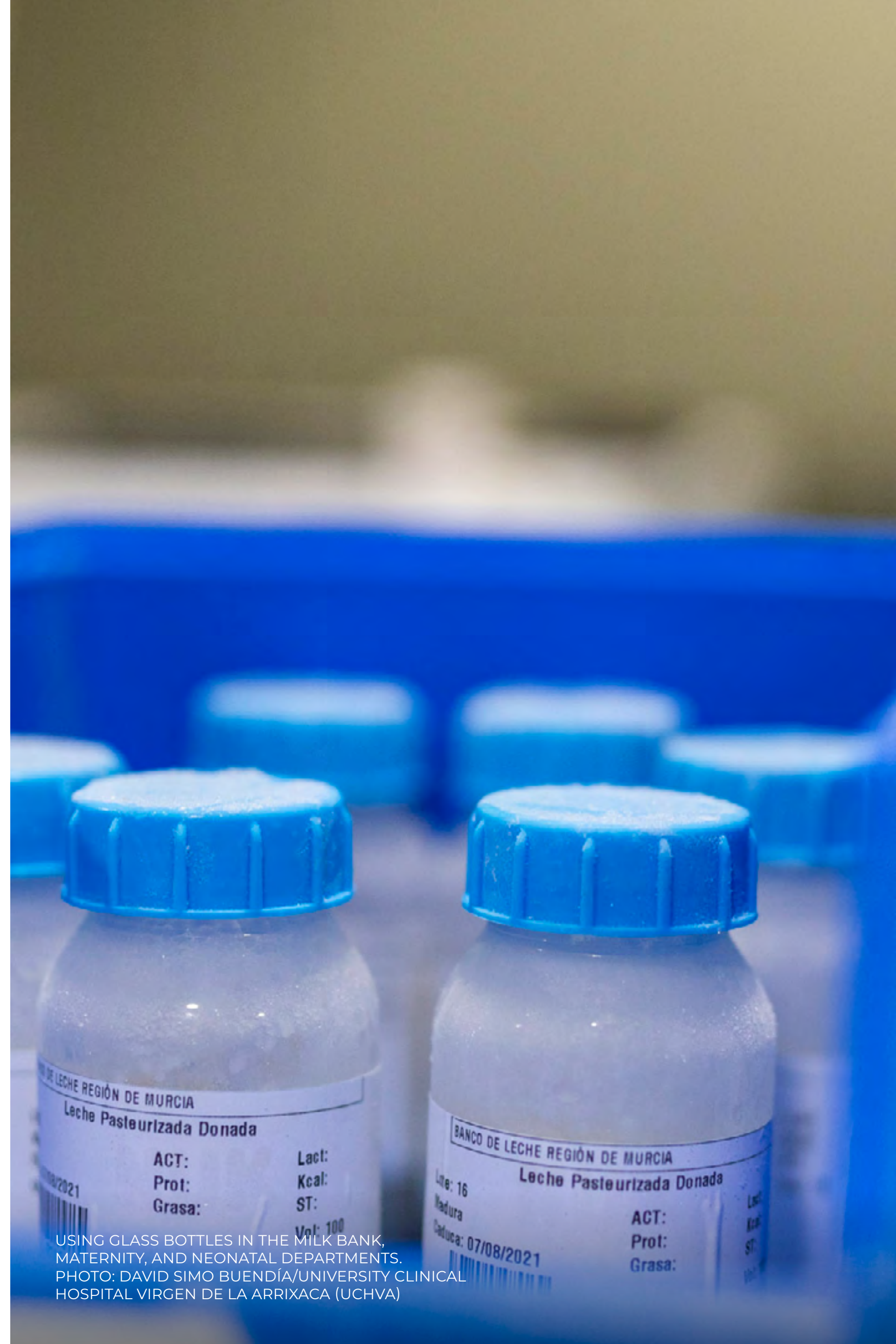
USING GLASS BOTTLES IN THE MILK BANK, MATERNITY, AND NEONATAL DEPARTMENTS.