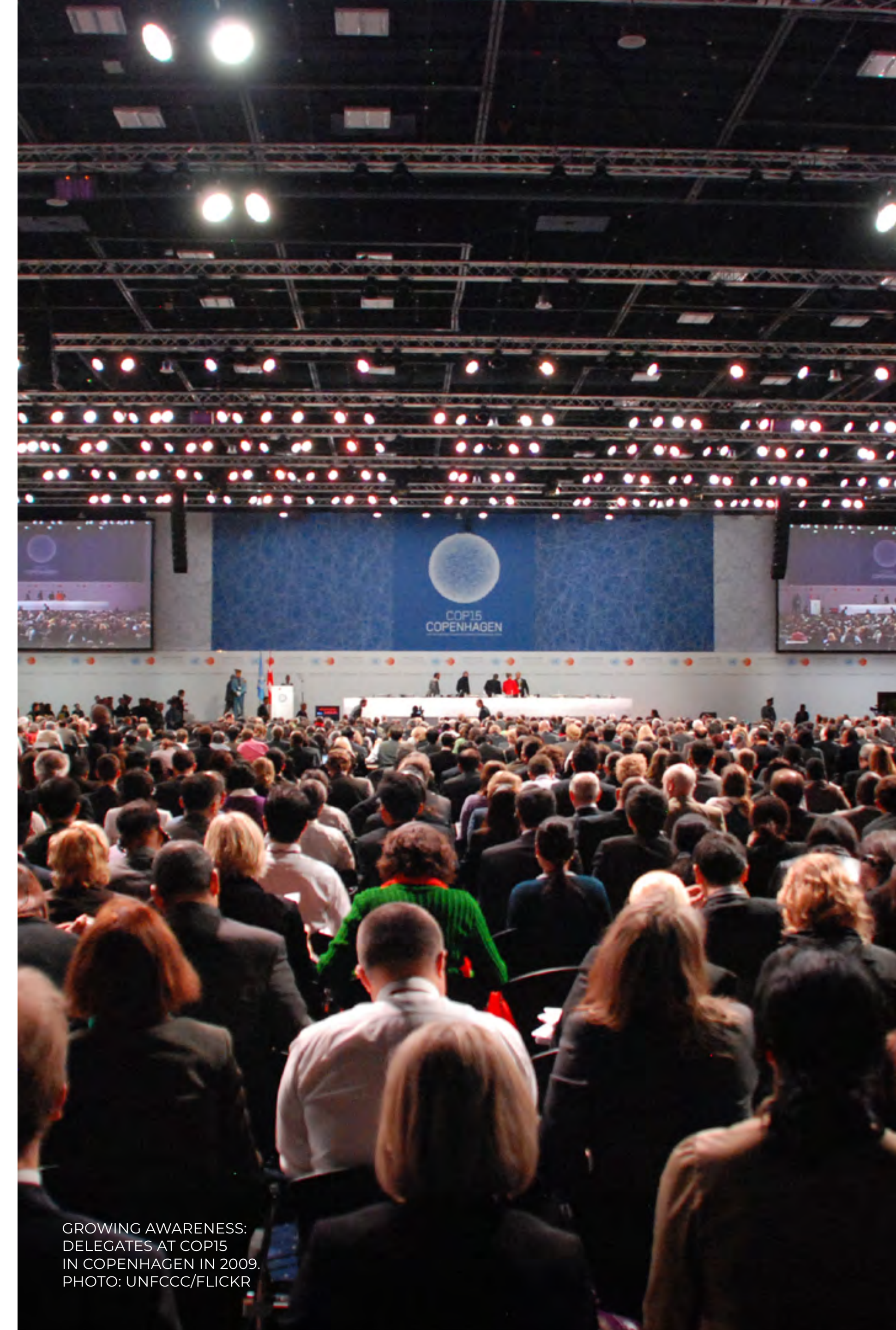
GROWING AWARENESS: DELEGATES AT COP15 IN COPENHAGEN IN 2009.