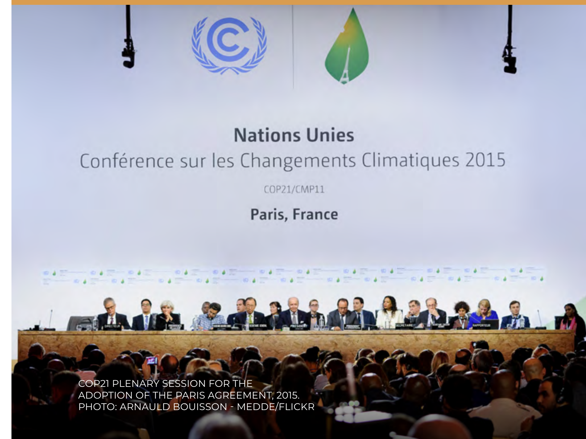
COP21 PLENARY SESSION FOR THE ADOPTION OF THE PARIS AGREEMENT, 2015.