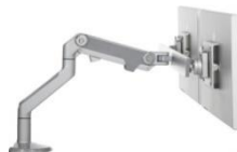
M8 with Crossbar