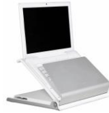
L6 Laptop Holder